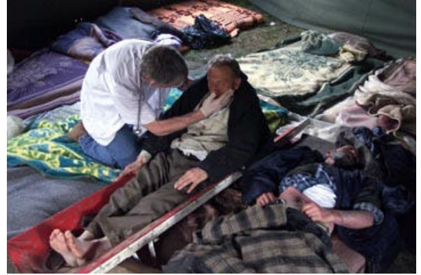
An ethnic Albanian being treated in Macedonia in 1999.

Workshop participants described how challenging and complex it is to coordinate in peacekeeping operations. In Mogadishu there were more than 580 NGO’s, all needing protection, many of whom were resistant to any suggestions to consolidate their locations for the security effort. These NGO’s were joined by a proliferation of international and participating governmental agencies. This pattern occurs in every similar operation. Despite some innovative limited successes at the tactical level, there still remains a decade later insufficient systematic organization and coordination.