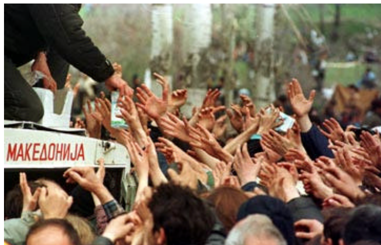
Aid being distributed to Albanian Kosovos refugees in 1999 in Macedonia.

Military ground forces are involved in all phases of post conflict, disorder to order, incapacity to capacity, and shaping environment to achieve a sustainable peace. While maintaining a dominant ground combat ready military force is essential, the military is also the predominant organization to fill initial shortfalls in all other areas. The post-conflict phase requires personnel capable of operating in the civilian interagency environment separated from the combat military units. Military personnel will be engaged in the systematic coordinating mechanisms in all areas. Information sharing in all areas and integrated execution of tasks is necessary. The military will be involved in establishing responsible public information systems. Planning with all before and during all phases of the nation-building operation is essential.