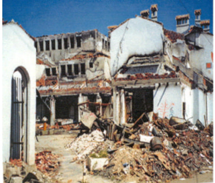
Destroyed buildings in Bosnia in 1996.

United States military doctrine currently precludes the military from taking the lead in organizing and staffing such a structure at the operational and strategic levels. As of now there is no other entity capable and present at the essential time to do this organizing in crisis response. Workshop participants opined that participation by the military is essential to organizing in peacekeeping operations.