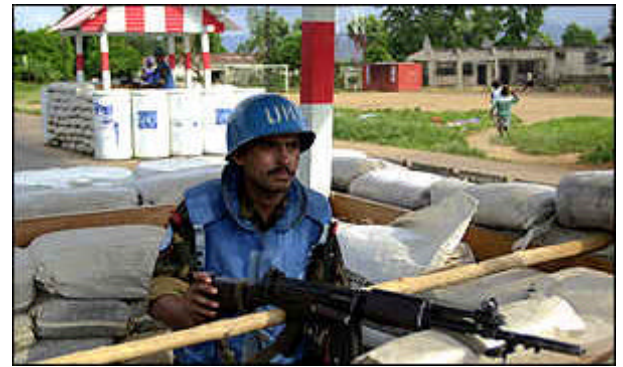
An Indian UN peacekeeper on duty in Sierra Leone in 1998.

The role of the military evolves over time as the area becomes more secure. Military personnel with other skills should replace some of the combat soldiers. Civil assistance specialists, engineers, administrative managers and military police with skills similar to their civilian counterparts are needed throughout the post-conflict transition phase. A representative from the Department of Justice opined that from his experience setting up a functioning police force takes at least nine months, even with international police officers, and even if everything goes as planned. Others suggested nine months was overly optimistic. Whatever its length the military must fill this gap during the transition to an effective civilian police force.